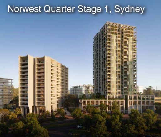
Norwest Quarter Stage 1, Sydney