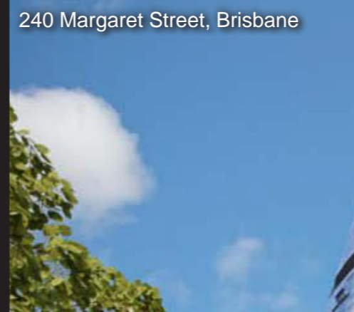
240 Margaret Street, Brisbane