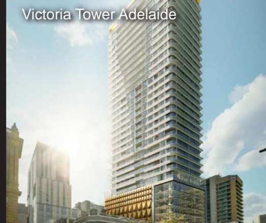
Victoria Tower Adelaide