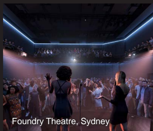
Foundry Theatre, Sydney