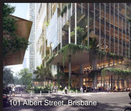
101 Albert Street, Brisbane