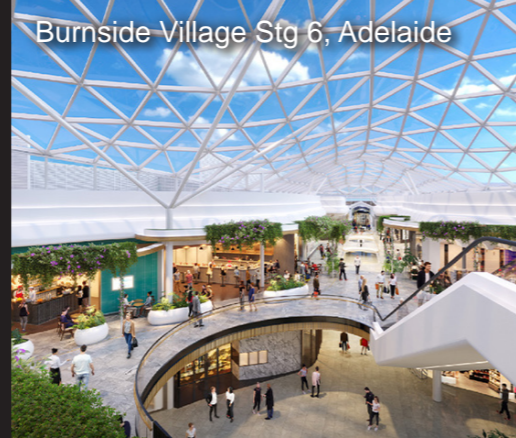
Burnside Village Stg 6, Adelaide