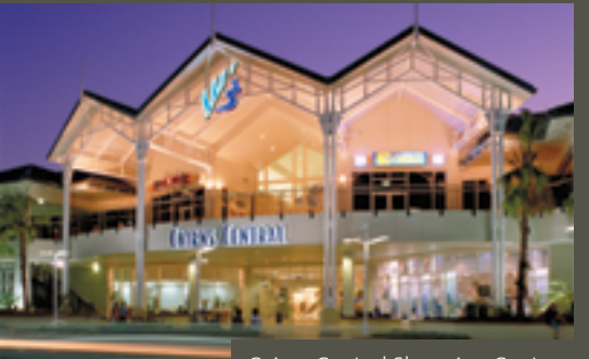
Cairns Central Shopping Centre