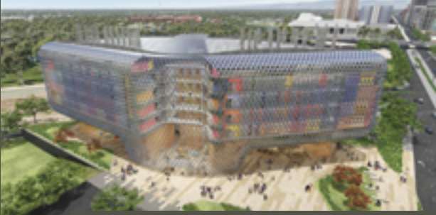
South Australia Health & Medical Research Institute