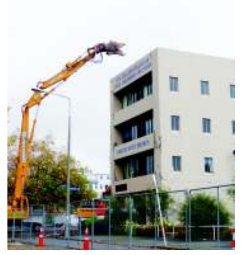
Due for Demolition, Early Childhood Education Building, 50 Victoria Street, Christchurch

RCP are also managing earthquake remediation for Ngai Tahu Property and the Canterbury District Health Board, and assisting Kiwi Income Property Trust with the damage assessment and tenant access to PWC Tower while continuing to deliver the BNZ Rollout. The Christchurch team is looking to the future and to assisting our clients in the redevelopment of the Garden City.