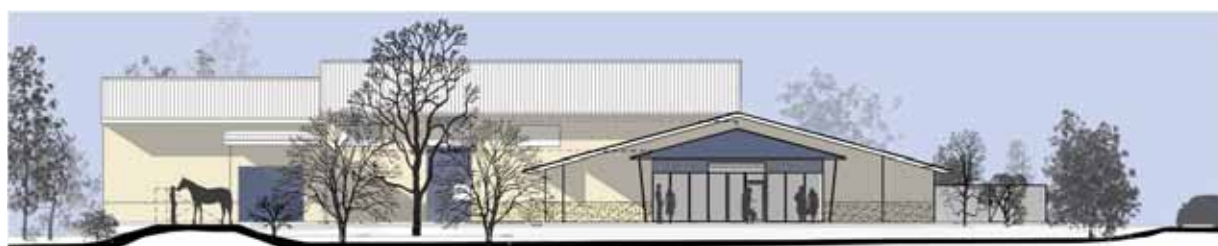
1 NORTH ELEVATION SCALE 1:500

The Design and Construct Contract has been let to TCS Qld Pty Ltd and construction is progressing well now that the wet season has finished. RCP look forward to the challenges associated with the construction of this complex medical facility.